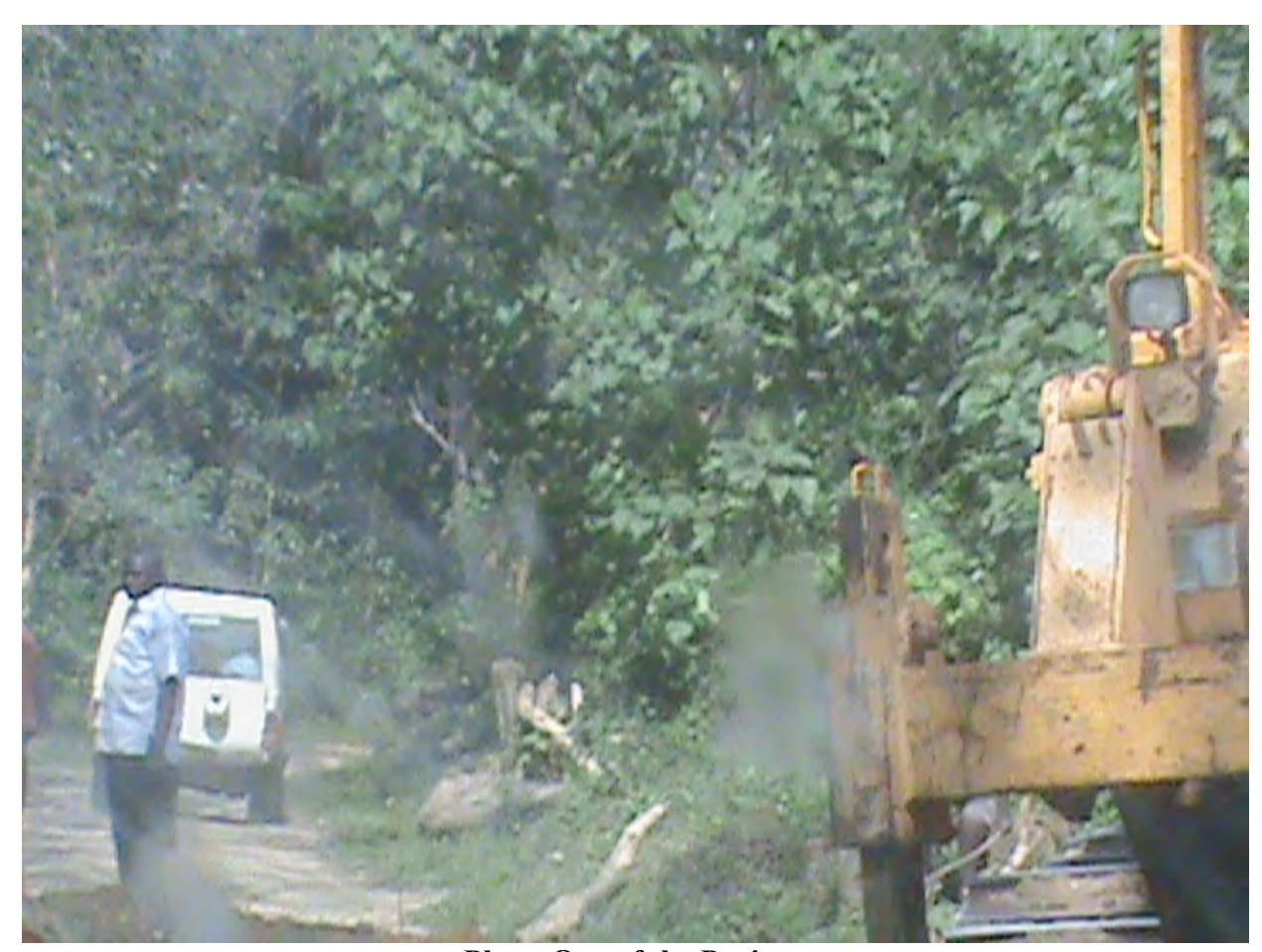
Phase One of the Project