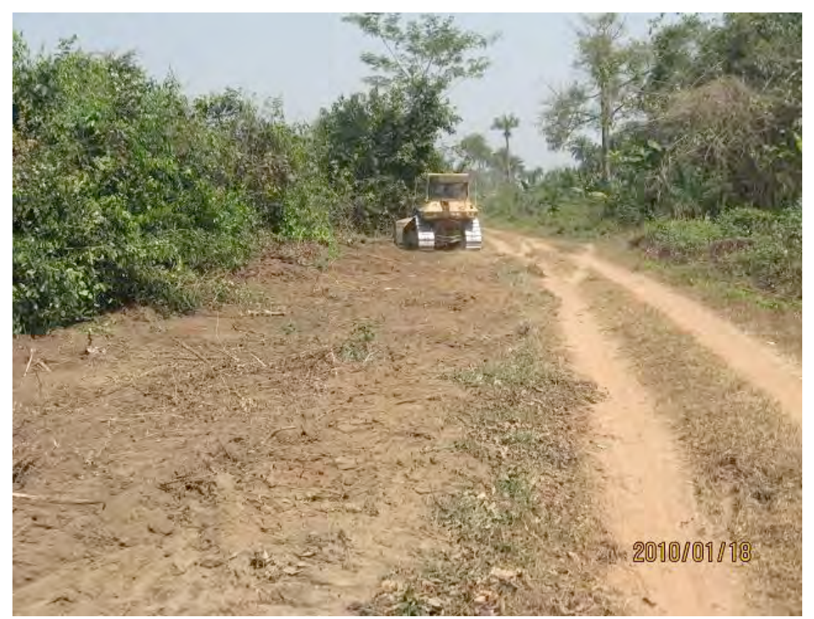
Phase One of the project involved mobilization of equipment, personnel, clearing of the brush, cutting down trees, removing tree stumps, rocks and top soil.