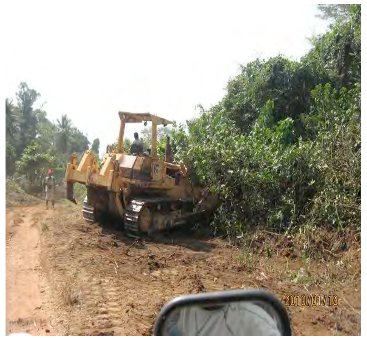
To speed this phase, SLRA has relied on heavy equipment, D8 and D6 dozers.

Mid-January SLRA reported that the crews had cleared 12 kms. from Manowa toward the Penguia Chiefdom, and 3 kms from Woroma in the Chiefdom toward Sandaru. SLRA estimated that 80 % of Phase One would be completed by January 29.